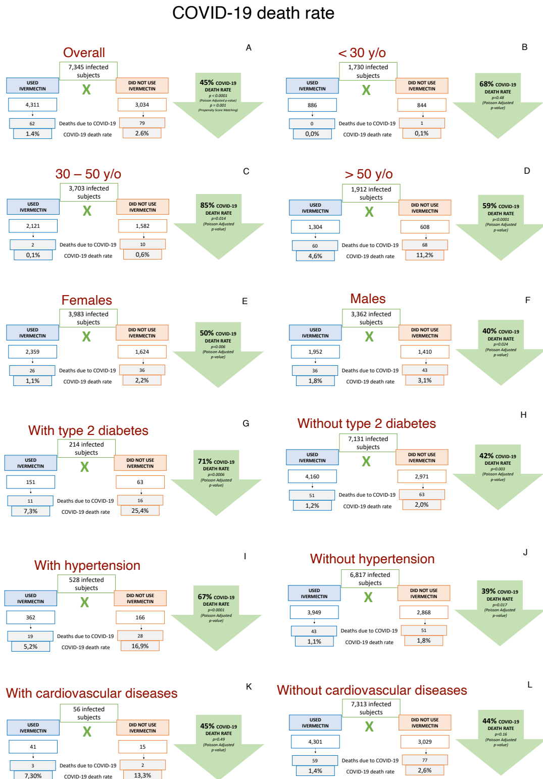
Figure 2. COVID-19 death rates in subpopulations.

A = Overall population; B = Below 30 years old (y/o); C = Between 30 and 50 y/o; D = Above 50 y/o; E = Females; F = Males; G = With type 2 diabetes; H = Without type 2 diabetes; I = With hypertension; J = Without hypertension; K = With cardiovascular diseases; L = Without cardiovascular diseases